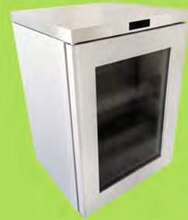
C41 Top Dry Section