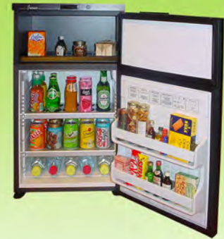
C41 Opaque White Glass Door