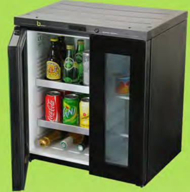
DD46 Top Dry Section