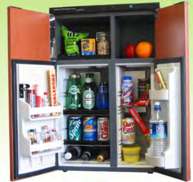
DD46 Opaque Doors