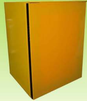
CH41 No-Top Version